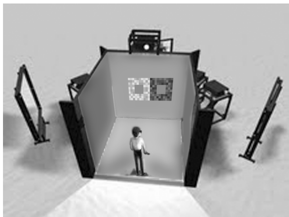
Figure 2: The CAVE system.

The laboratory room was darkened; there were no any light sources, except CAVE systems projectors. The luminance range in stimulus scene was 1:230. The maximum luminance was 5.5 \text{ cd/m}^2 , the minimum – 0.02 \text{ cd/m}^2 .