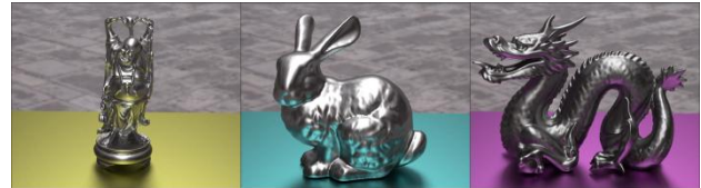
Figure 1: Testing scenes: Stanford Buddha, Bunny and Dragon.

This paper is further structured as follows. Section 2 summarizes the previous work of ray-triangle intersection on both CPU and GPU and performance comparison on those algorithms. Section 3 describes our choices for implementation. Section 4 shows the result from measurements on two GPUs for a set of scenes. Further it discusses the bottlenecks of a contemporary GPU architecture for ray tracing algorithms. Section 5 concludes the paper with possible perspectives for future work.